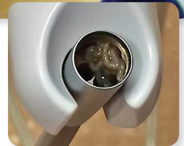
Right: Biofilm growth in a dental waterline