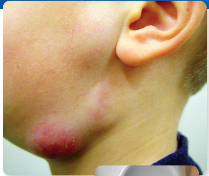
Above: Lymphadenitis caused by Mycobacterium infection

Pediatric patient's mother notifies the Virginia Department of Health Professions of negligent waterline infection control practices.