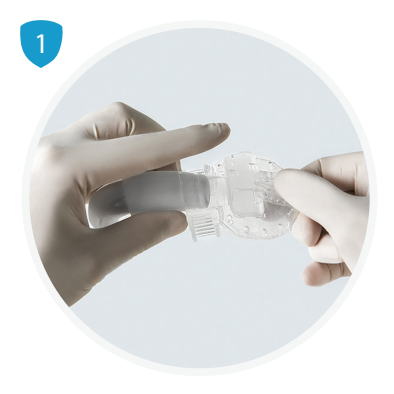
Fold tail in towards the center of the mouthpiece.