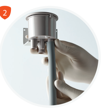
Connect Y Connector hose to canister's port.