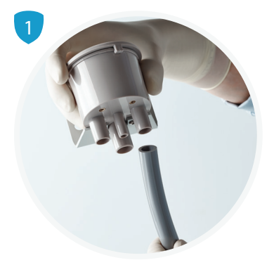
Disconnect standard HVE hose from main canister.