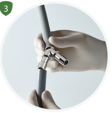
Attach standard HVE hose to one end of the Y Connector.