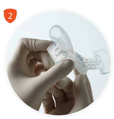
Slide bite block onto mouthpiece, ensuring that the plug is locked in place and the strap lies flush with the mouthpiece.*