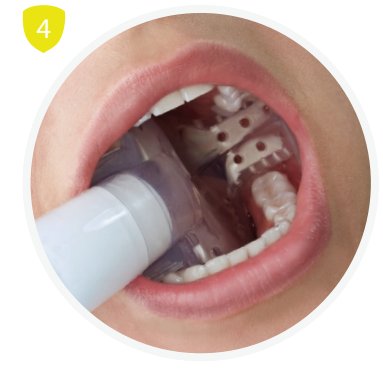
Release the mouthpiece, allowing the tail and outside edges to fall back into its natural position.

Slowly insert in the center of the mouth, lining up the bite block's anterior edge to distal of the canine (For kids, midline of the primary lateral).