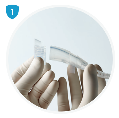
Line angle of bite block strap with the angle of strap region on mouthpiece.