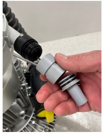
Re-Install Hose Adapter