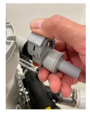
Push Clip Down to Attach