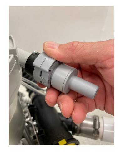
Install New Hose with Clamp