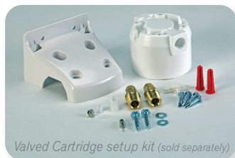
Valved Cartridge setup kit (sold separately)