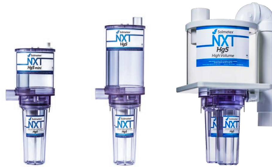
NXT Hg5 mini (1-4 Chairs) | NXT Hg5 Standard (1-10 Chairs) | NXT Hg5 High Volume (1-20 Chairs)

The Hg5 series meets all requirements of BMP's and "EPA Dental Rule", plus adds value to the equipment room by extending the life of your vacuum system.