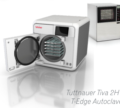
Tuttnauer Tiva 2H and T-Edge Autoclaves