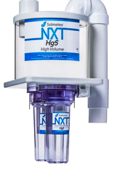
NXT Hg5 High Volume 1-20 Chairs