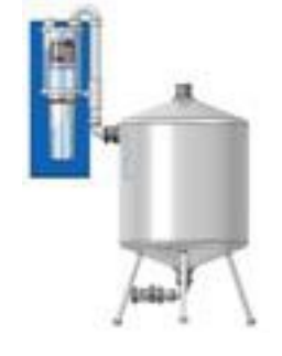
Hg5 w/ 30 Gallon Tank