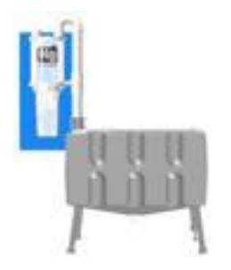
Hg5 w/ 15 Gallon Tank