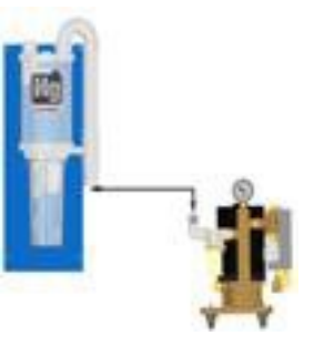
Hg5 w/ Water ring pump