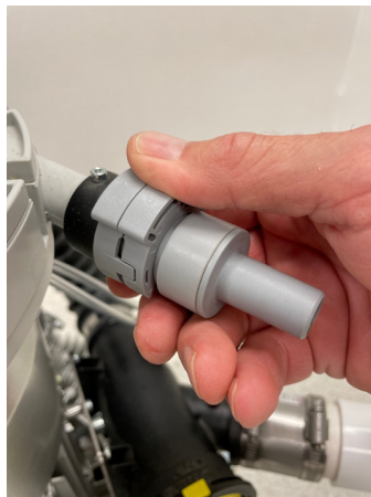
Push Clip Down to Attach