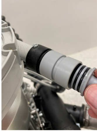
Remove Hose Adapter