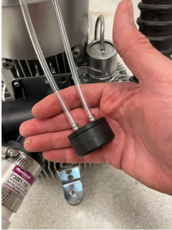
Locate Water Collector Valve