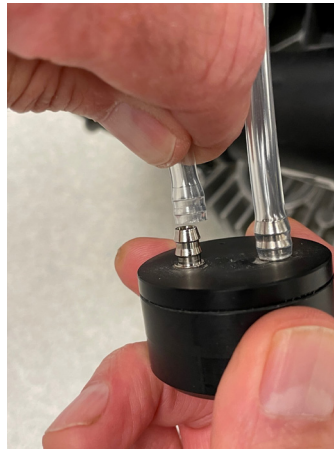
Hold Valve Firmly, and Push On Tube