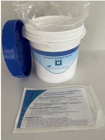
Read Recycle Instructions