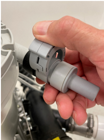
Align Rear Retainer Clip