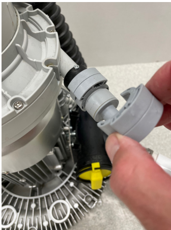
Remove Two (2) Retainer Clips