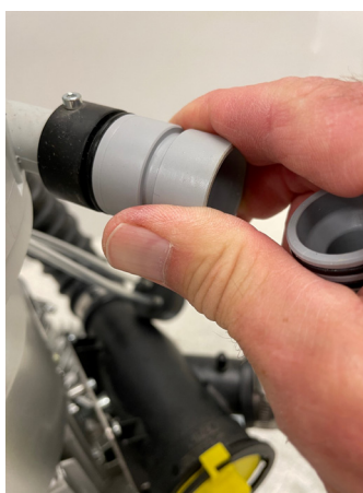
Install New Outlet Connector