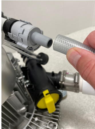
Remove Outlet Hose