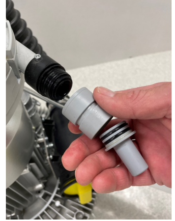
Remove Outlet Connector