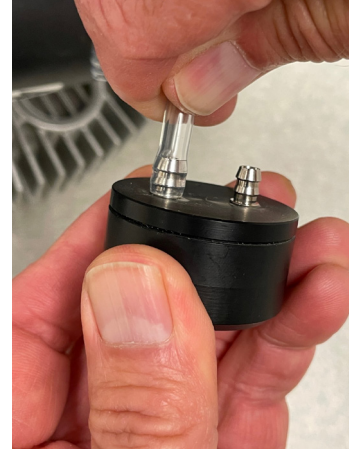
Detach Both Tubes