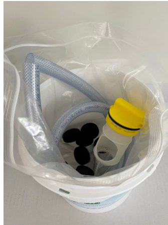
Discard Used Components