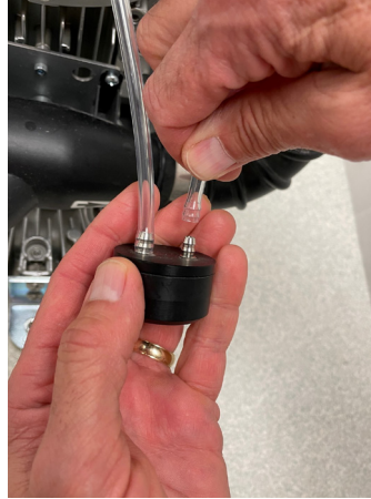
Hold Valve Firmly, Pull Off Tube