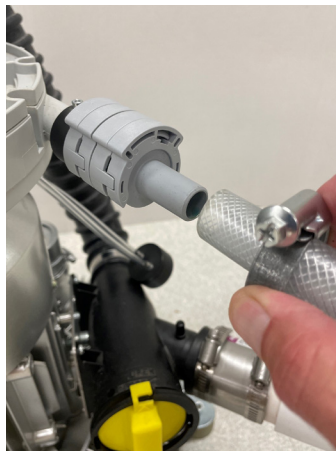
Install New Hose with Clamp