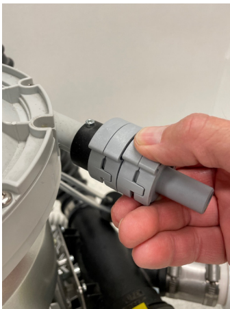
Push Clip Down to Attach