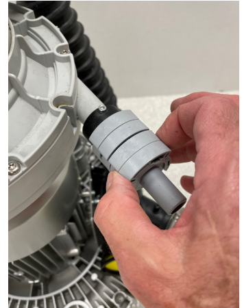
Lift Up on Retainer Clip