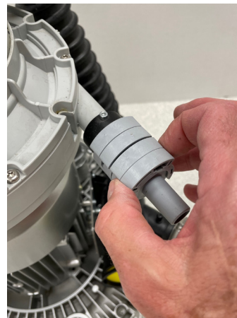
Align Front Retainer Clip