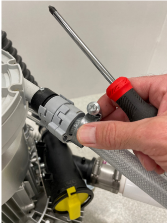
Loosen Outlet Hose Clamp