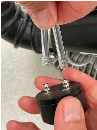
Align New Valve with Tubes