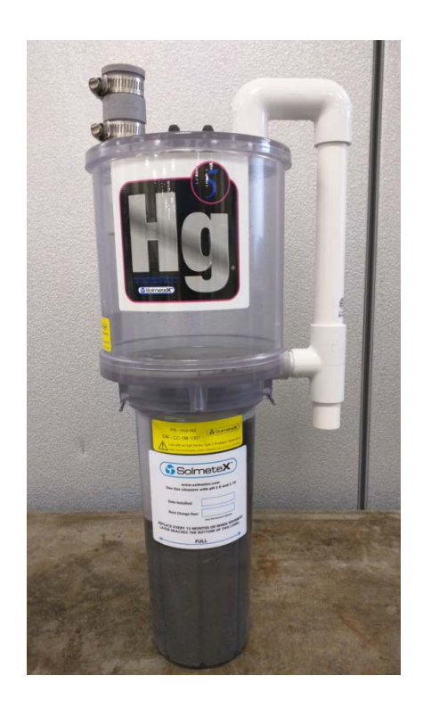
Figure 1 – Hg5-Mini with collection container series CC-1M

Vacuum collection system wastewater enters the Hg5-Mini surge tank and then drops by gravity into the removable CC-1M sedimentation vessel, where heavy particles can settle out. Wastewater flows from the sedimentation vessel through a flow control outlet device and back into the vacuum line. Suction from the vacuum system does not impact sedimentation as the flow path for air is separate from the flow path for liquid. Air exits the top of the surge tank to bypass the sedimentation vessel.