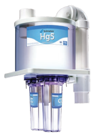
Hg5 High Volume Amalgam Separator