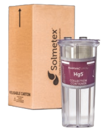
RAMVAC Utility Collection Container

with Recycle Kit [legacy] Item # HG5-002CR