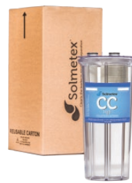
Hg5 Collection Container

with Recycle Kit [legacy] Item # HG5-002CR