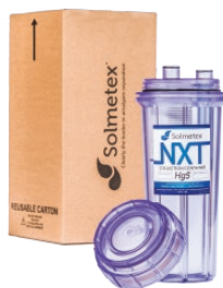
NXT Hg5 Collection Container